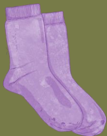
's' in socks