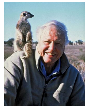
Sir David Attenborough Natural Historian