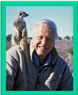
Sir David Attenborough Natural Historian