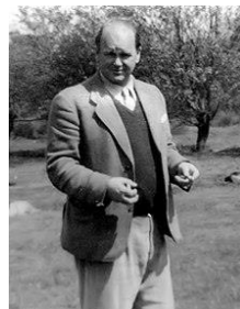
Sir Peter Scott WWF and WWT