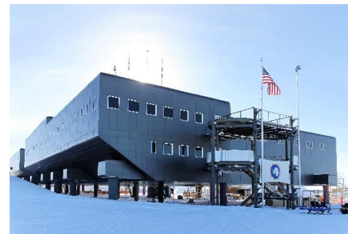
South Pole Scientific Station