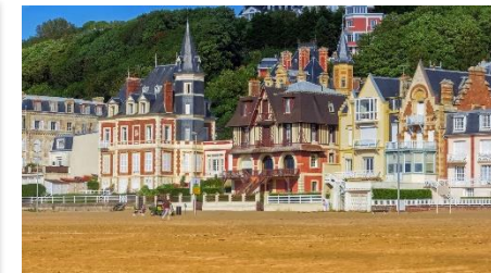
Trouville Sur Mer

Physical features - coast, Mont des Avaloirs, four regional natural parks, River Orne, Rock of Oetre.