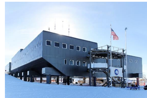
South Pole Scientific Station