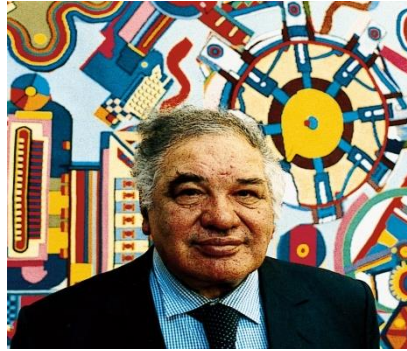
Sir Eduardo Paolozzi