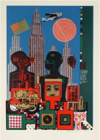
Wittgenstein in New York

We are curious, we are unique, we are together, we are Whiteshill!